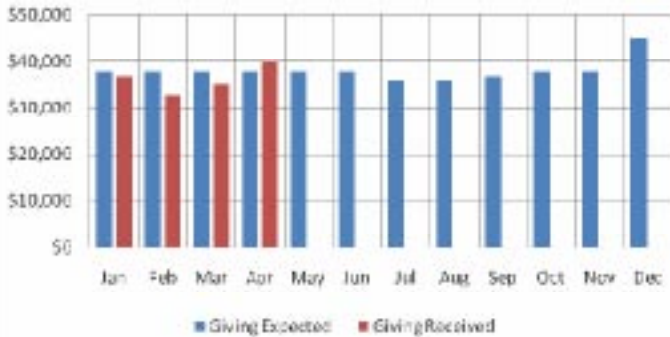
Giving -April YTD

It is encouraging that our giving for the month of April exceeded expectations by $2.8K. Also, pledge giving for April Year-to-Date (YTD) matched our expectation. However, our “non-pledge” giving for April YTD is off $6.9K (people who give regularly, but are unable to pledge, are in this category). The deficit for the month of April is primarily due to insurance and property tax payments, which are periodic.